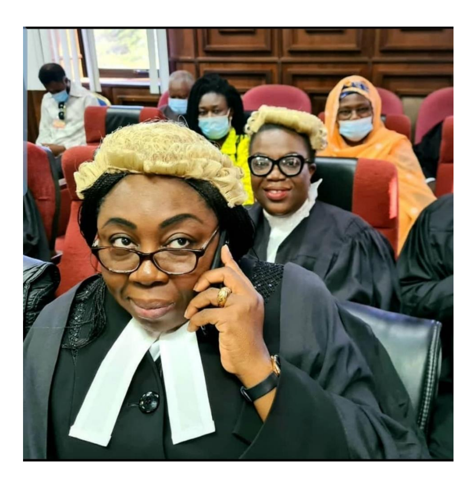
Vision Spring Initiatives in court as a Plaintiff seeking an enforcement of women's participation in decision making

The hearing of the case was adjourned to February 5 2021 and holds at the Federal High court Abuja. On February 5, a few members were physically in court due to Covid-19 pandemic. On the said date, the defendants to the case pleaded for an adjournment. The case was adjourned till April 13, 2021.