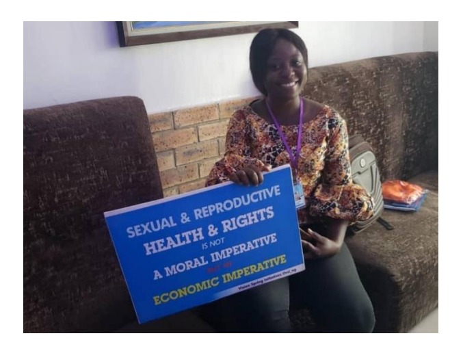
VSI volunteer during a refresher training

Health Coverage Declaration; and to enhance partnership with lawmakers, religious and traditional leaders and media towards change in social norms.