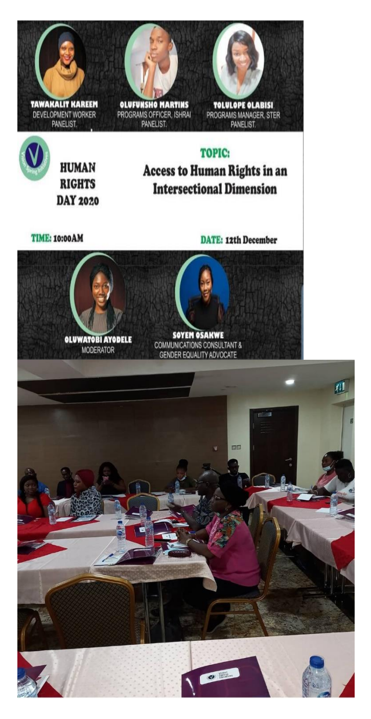
Participants and panellists at the event