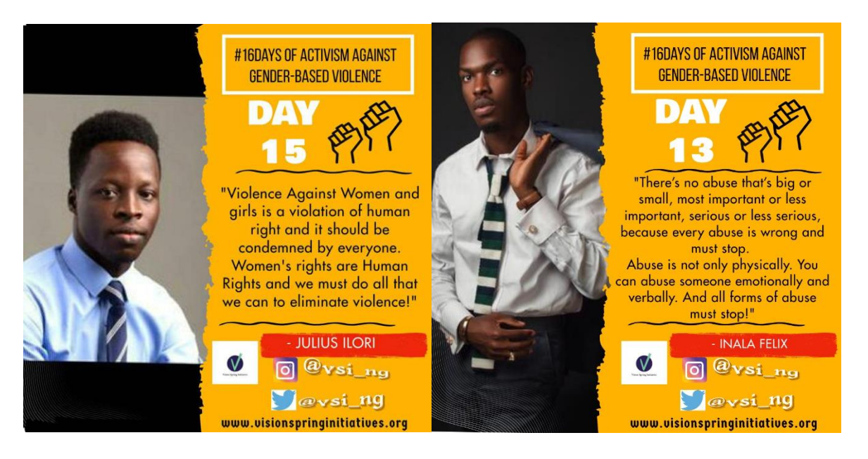
Some quotes from the campaign by VSI staff, volunteer and male champions

On the 12 of December 2020 was Universal Health Coverage Day and VSI celebrated it alongside Human Rights Day which was December 10. The theme for UHC was Health for all: protect everyone. VSI held a panel session with young feminists and other activists to discuss "Access to Human Rights in an Intersectional Dimension". The session highlighted how we all hold multiple social identities simultaneously, such as race, gender, and sexuality and how Intersectionality examines how multiple oppressed identities interact to create overlapping and compounding systems of disadvantage. At the end of the session, it was agreed that everyone need to respect the voice of those most affected by issues by centering their voices, respecting their goals for their communities, and stepping aside and allowing them to serve as spokespeople for their own causes. Valuing voice means lifting up, promoting, and supporting the leadership and storytelling of those most affected by policies and practices and centering their substantive suggestions and values into any given project and media advocacy. The print and Television media were also present to discuss their role in ensuring universal health coverage is achieved in Nigeria and no group is left behind.