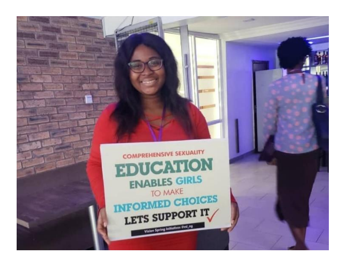
VSI volunteer at the training

sexuality education using designed placards with Sexual and Reproductive messages.