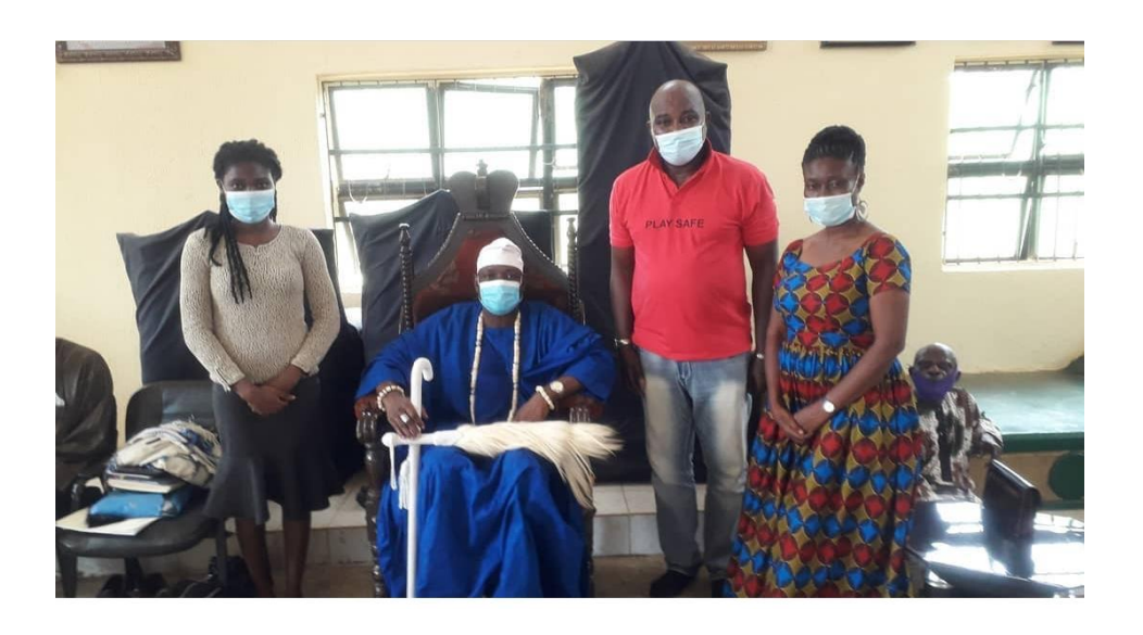
Advocacy visit to the Oba of Igbogbo in Ikorodu Lagos by Vision Spring Initiatives staff

The organisation in partnership with Education as a Vaccine (EVA) and UNESCO hosted series of school programs from November 2019 to March 2020 in Lagos Nigeria. The 03 projects; our rights, our lives our future program 2018-2020 aims for a consistent reduction in new HIV infections, early and unintended pregnancy, gender based violence and child marriage. Training methods employed include slide presentations, role plays, group exercise, and experience sharing which proved very productive. This was evidenced by the increase in knowledge and pledge to attitudinal change and willingness to pass the knowledge gained at the end of the trainings by participants.