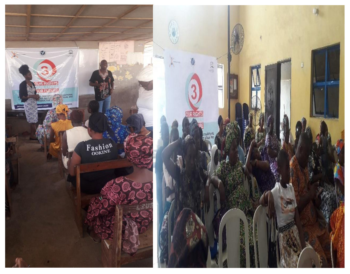
Cross section of parents at the UNESCO supported education project

Comprehensive Sexual and reproductive health and rights of women and girls still have not received adequate attention. Through partnership between UNESCO and Education as a Vaccine the organisation was able to boost its school program. It became critical to reach parents through the parent-teachers association to understand their level of commitment to the education of girls. Others reached with this intervention are community leaders and school teachers.