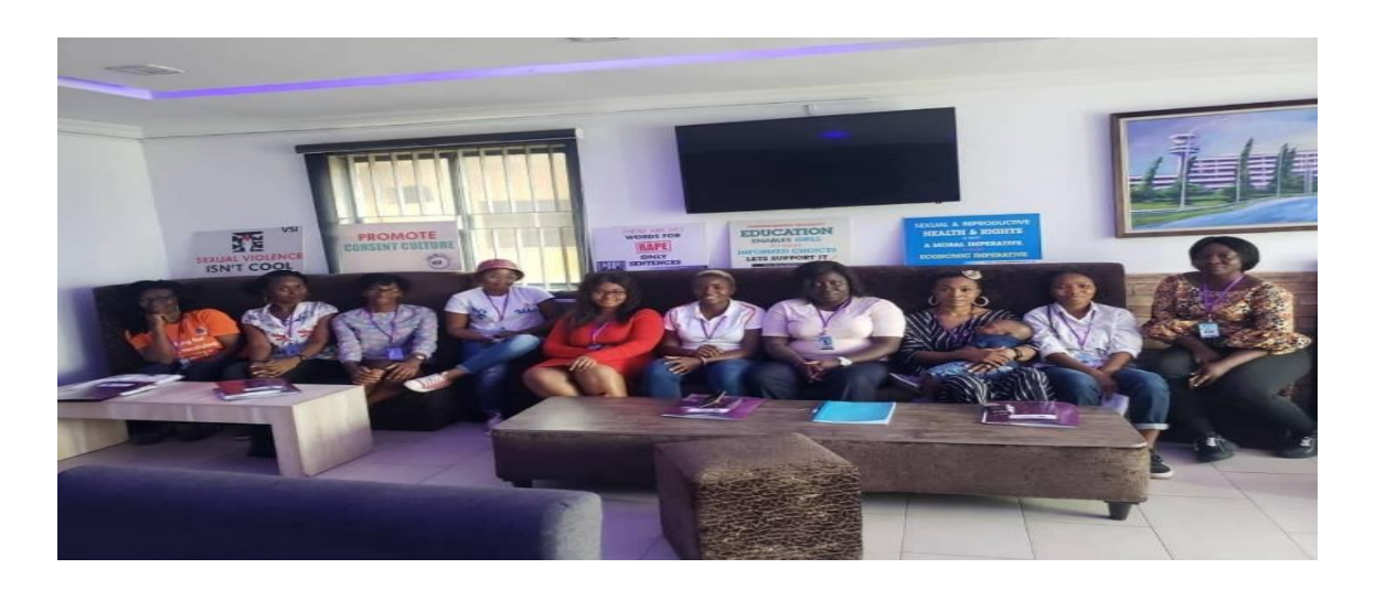
Girl impact project volunteers

The project currently trains 200 students in two schools in two local government areas of Lagos state; Sceptre International Secondary School Kosofe and De Keepers International School Ikorodu. The organisation developed one year manual comprising topics on Self-esteem, gender and sex, human rights, ending gender based violence, career choices and development and sexual and reproductive health and rights.