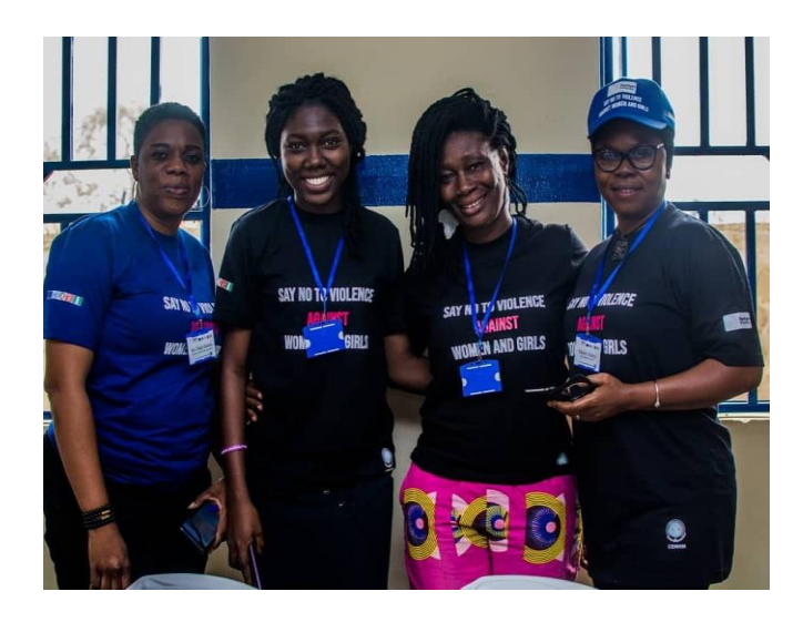
VSI representatives and other participants at the workshop.