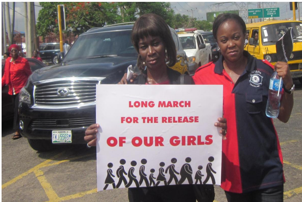
March to the Lagos state government house.

In April 2014, Vision Spring was saddened by the abduction of more than 200 school girls from their school. The organisation visited Bornu where it provided psychosocial support to the mothers of the abducted girls. Working with Echoes of Women in Africa the organisation organized press and civil society briefing condemning the act and challenging government to intensify effort towards the release of the girls.