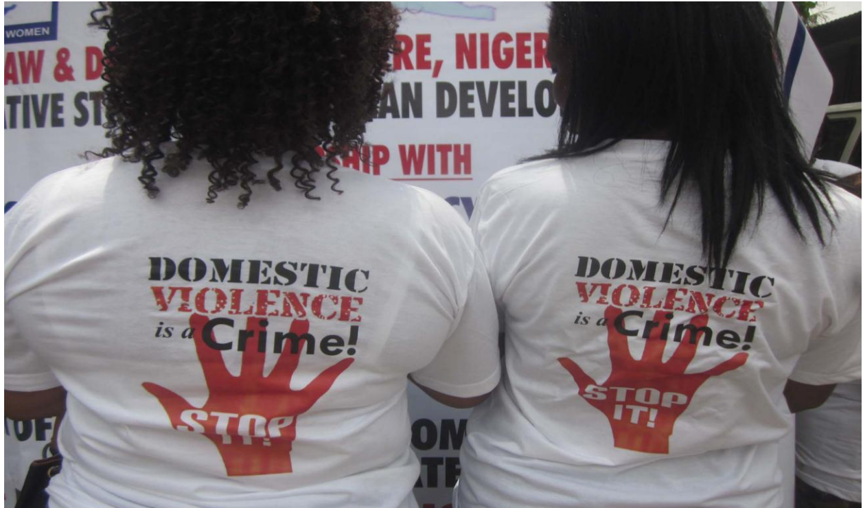
Members of the non-violence campaign at Onigbongo, Ikeja LCDA Lagos Nigeria