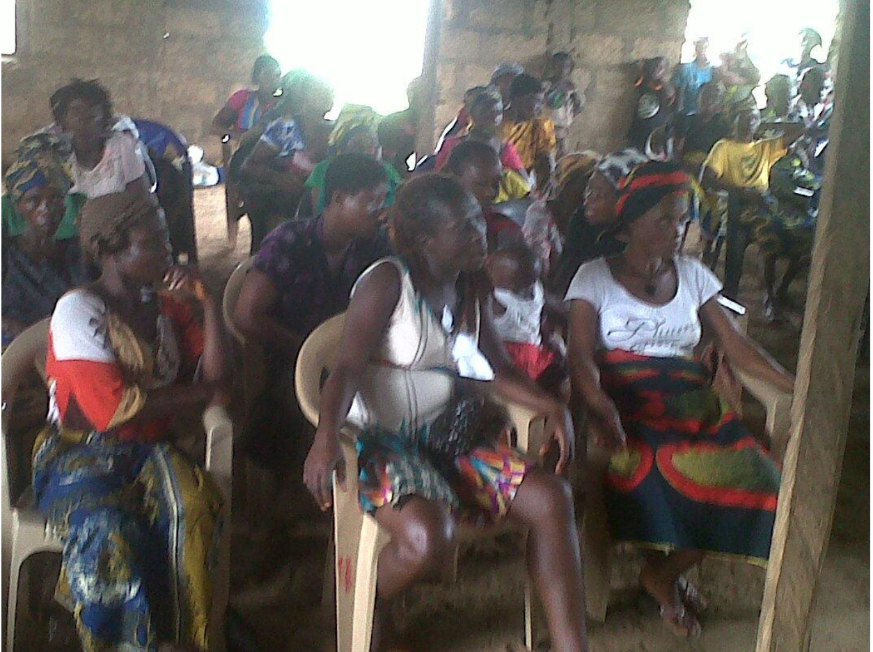
Political education training in Ebonyi state

In 2015 working with G6 members, the organisation developed a 75 page report on Beijing 20 years after. The report made the following suggestions towards enhancing women's political participation: