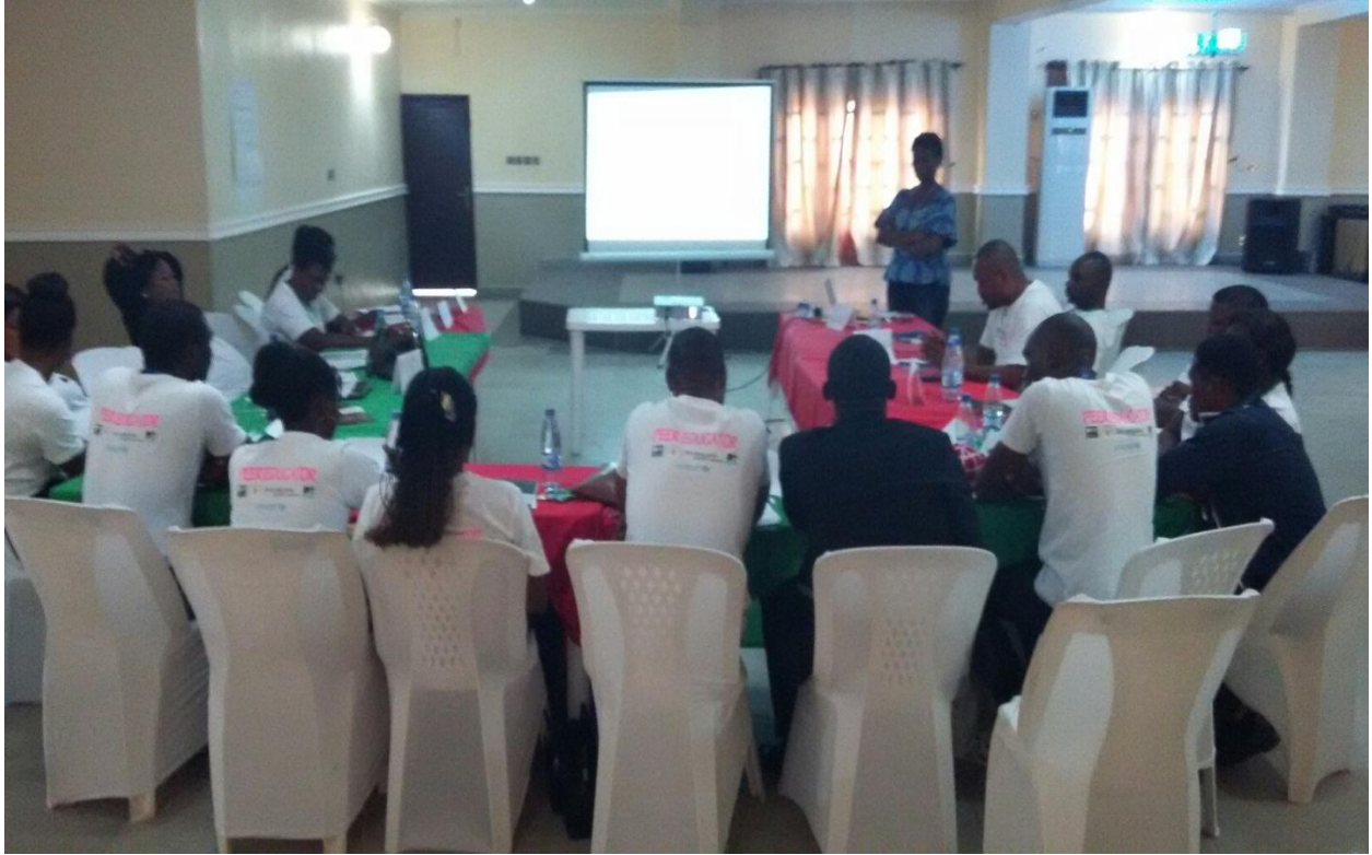
Shuga peer education training

At the end of the trainings, young people confirmed that it challenged them to find their voices and their hearts and effectively express it in ways that can enable them decide to live productive lives, protect themselves, their peers and their communities and ultimately adopt responsible behavior.