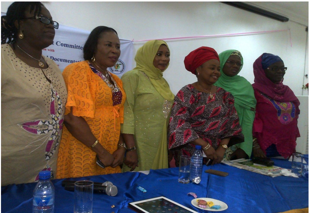
Cross-section of heads of CSOs and women in politics at a UNDP sponsored event, Abuja Nigeria

Vision Spring Initiatives is a member of More Women Movement with the conviction that true democracy must mean women's full participation in leadership and decision making processes. True democracy is characterized by the full and equal participation of women and men in the formulation and implementation of decisions in all spheres of public life. Vision Spring Initiatives in the years under review conducted participatory leadership sessions with women and girls. This is premised on the understanding that women and girls are still far from where they should be both in the private and public spheres.