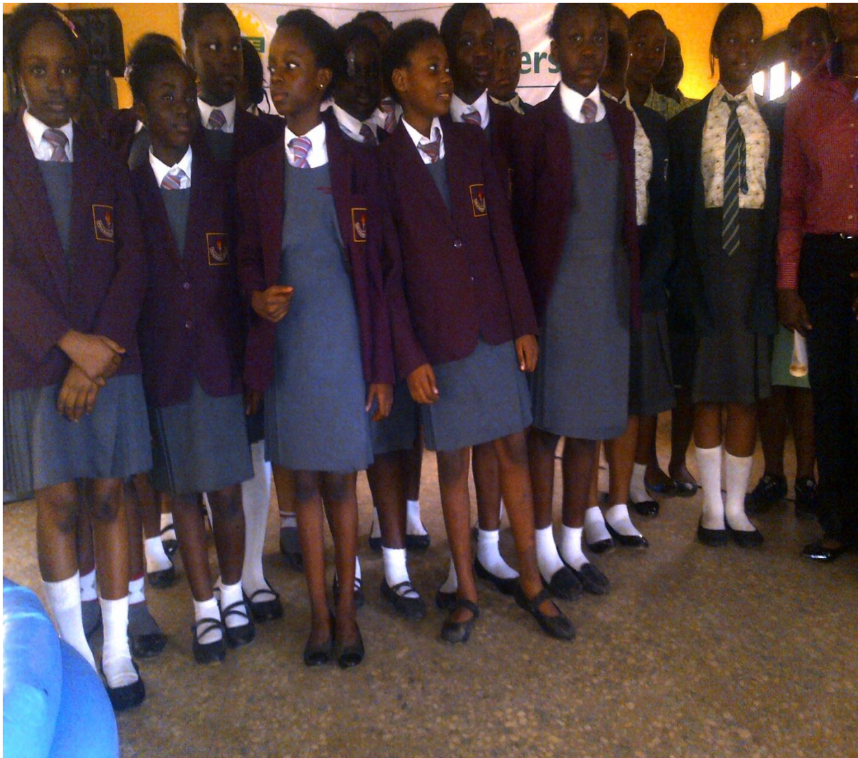
Beneficiaries of VSI's Gender and Leadership Education in partnership with Working to Advance African Women (WAAW) supported by Google

In the realization of its objective on research and education which is to promote and advance education and research in Nigeria, Vision Spring initiatives engaged in a number of activities in the years under review. 3 Public schools were contacted to gain insights into educational curricular and how the education provided by those schools is beneficial to the recipients. At the three schools surveyed, it was clear that the beneficiaries had no input in the design of curriculum. This is against the backdrop of the past conversations VSI has had with 60 students of three schools studied. The students had expressed the value of engaging young people through the provision of inclusive and participatory education which will enable them to express their creativity in a supportive and clean environment.